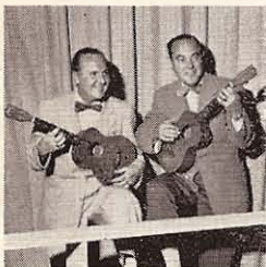
HUM & STRUM National Broadcasting Co. WBZ-TV