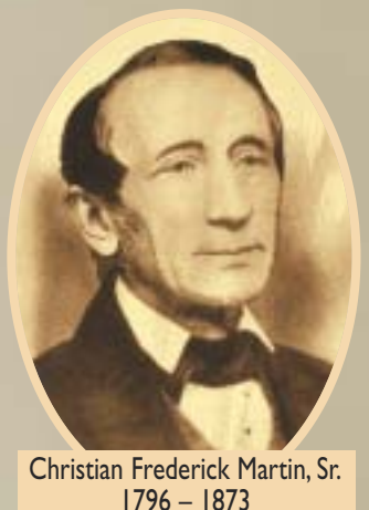
C. F. Martin & Co. is grounded in tradition, going back more than 175 years to young Christian Frederick Martin's apprenticeship in Vienna.

As demand for guitars has risen, we've risen, building more and better guitars at superior quality. Today we offer over 120 models of various sizes, styles and affordability. In addition to our famous Dreadnoughts and other Martin traditional styles, we regularly introduce models that address changing player preferences – cutaway models, acoustic electric models, alternative and sustainable wood models, mini and travel guitars and scores of Limited Editions and Artist Signature models.