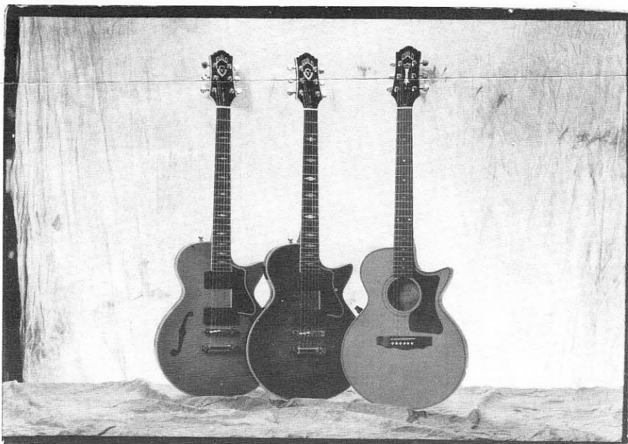
Nightbird Nightingale Songbird

The Nightbird series guitars all feature solid mahogany construction. Standard Nightbirds and Nightingales come with solid spruce tops, as does the Songbird. The Nightbird is also available with a highly figured maple top. The Nightbird features exclusive acoustic chambers in the body, increasing sustain and giving the guitar a warm "presence", unlike standard solid-body guitars. The Nightingale features a carved spruce top with F-holes, revealing the acoustic chambers within.