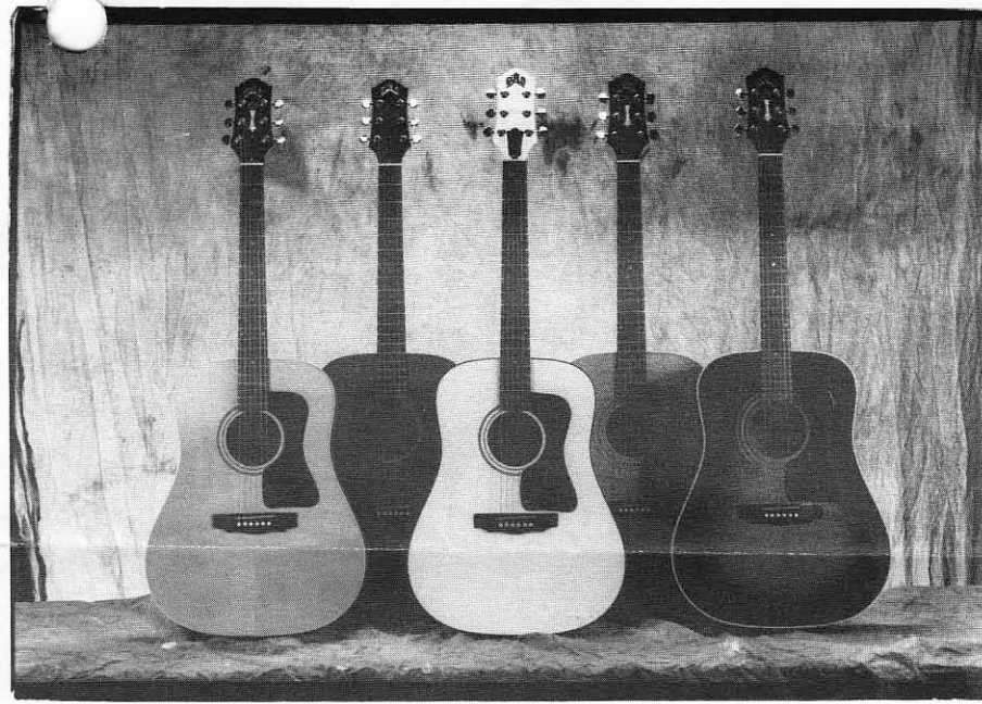
D-30 D-15 D-25 D-40 D-50

Guild acoustic guitars are handmade in America, by Guild craftsmen with years of experience building the world's finest production guitars. The Dreadnought guitar, long the favorite of flatpickers, offers a prominent, punchy bass, with a clear ringing treble. The GF-series guitars, with their larger body, offer a richer, warmer tone, with excellent balance and projection. The JF-series jumbo guitars offer a large, strong bass, with a soft and even treble, and excellent sustain.