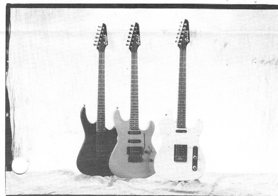
Liberator Detonator T-250

Guild solid-body electric guitars are built to the same exacting standards as the famous Guild acoustic guitars. The Detonator and Liberator feature the Guild non-locking tremelo system. Crafted from solid brass and steel, the Guild tremelo, combined with Sperzel Trim-lok tuning machines, can stand up to the most extreme tremelo technique, and consistently stay in tune.