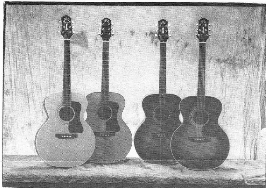
GF-40 GF-25 GF-30 GF-50

The GF series of guitars from Guild feature a slightly larger body than a Dreadnought, offering a balanced, even tone, with excellent sustain and projection.