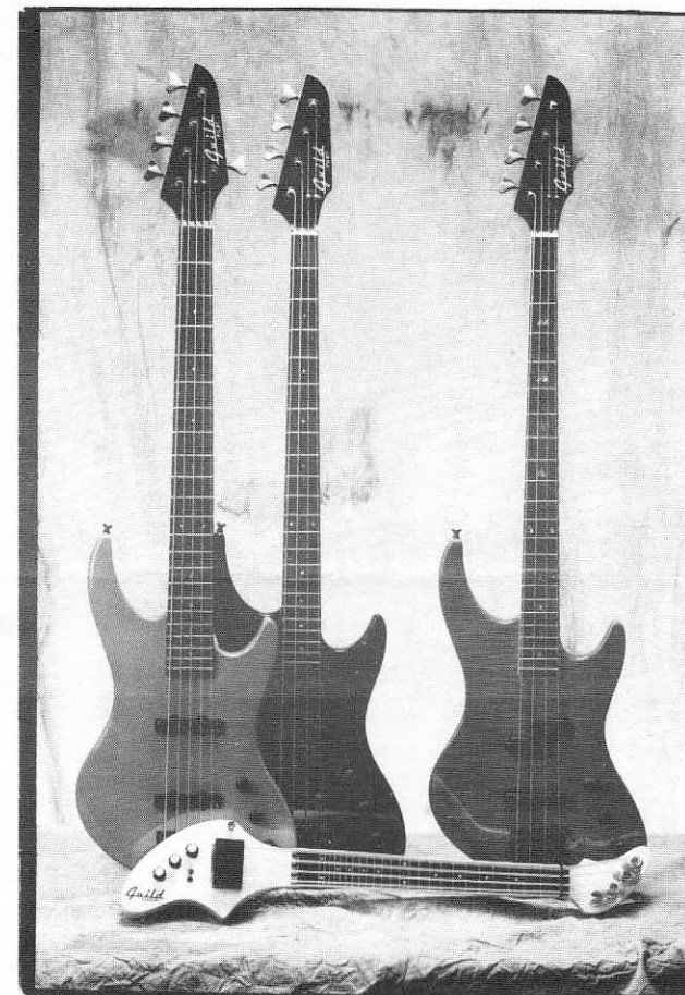
SB-605 SB-602 Ashbory SB-902

The Guild Pilot Basses are recognized throughout the music world as the best-selling bass guitars in America. Lightweight Poplar bodies coupled with satin-finished maple neck result in an instrument with incredible sustain, brilliance and punch.