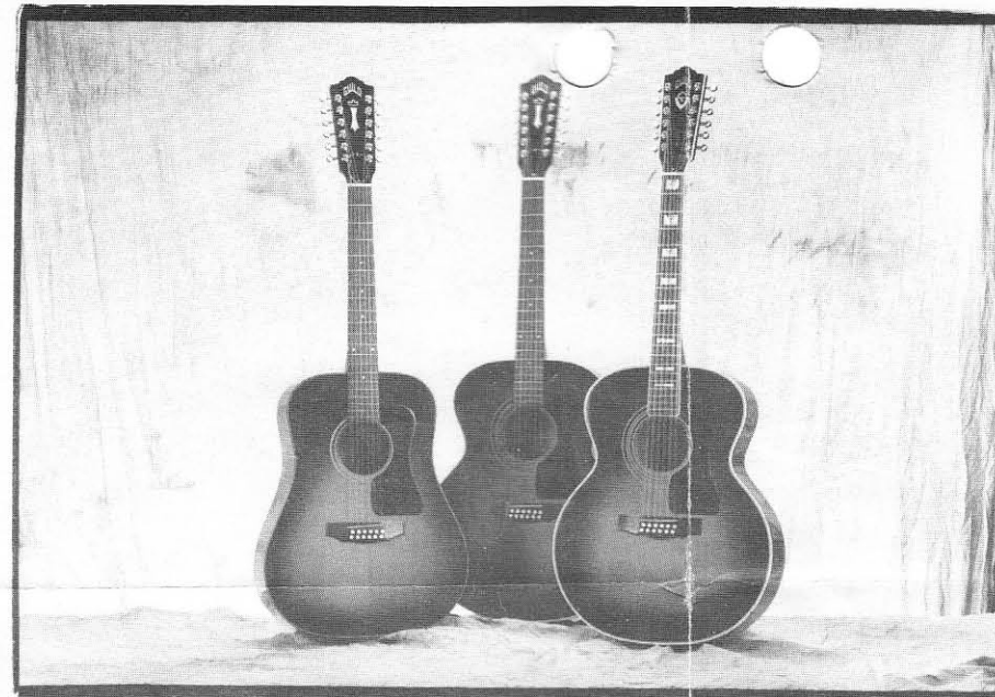
D-25/12 GF-30/12 GF-65/12

Guild twelve-string guitars are famous the world over for their remarkable brilliance, sustain, and balance. Every Guild twelve-string utilizes Guild's dual truss rod arrangement, assuring that each guitar will retain its excellent playability for years. Guild twelve-strings are noted for their loud, singing tone, and their excellent projection. The GF-65/12 features the traditional Guild block inlays, multiple binding, and ebony fingerboard.