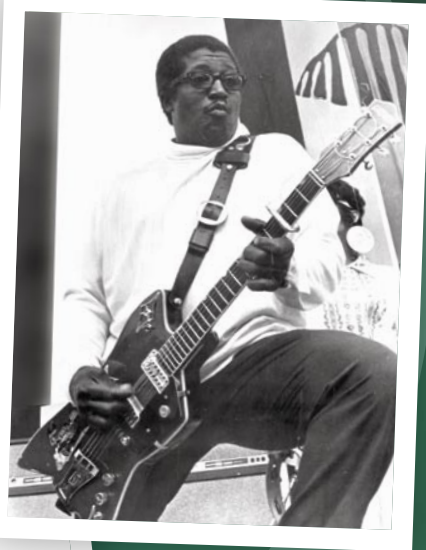
Bo Diddley

"Some time ago, Bo gave me the guitar as a gift. It was during the recent ZZ Top recordings, when the engineering crew and I snaked through the guitar vault searching for that 'certain-something' guitar and there it was! We didn't risk subjecting such a rare instrument to the rigors of the road. So, this new reproduction model was recreated with some BFG Mojo thrown-in for good measure. It's now the main stage guitar with a groove." – Billy F Gibbons