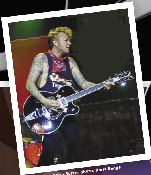
Brian Setzer

"All the right stuff with a little glitz thrown in for good measure!"