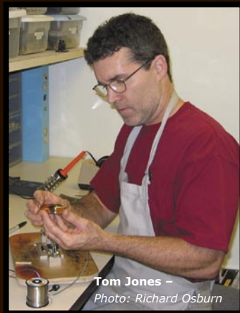
Tom Jones

The Spectra Sonic bass features a three-piece maple neck with 33" scale and 21 frets joining the neck at the 15th fret, African padauk fingerboard with off-white dot inlays and corresponding side dots, chambered alder body with laminated spruce top measuring 15 1/4" wide and 1 7/8" deep, custom made TV Jones® alnico Thundertron bass pickups, master volume, master tone and three-way pickup selector.