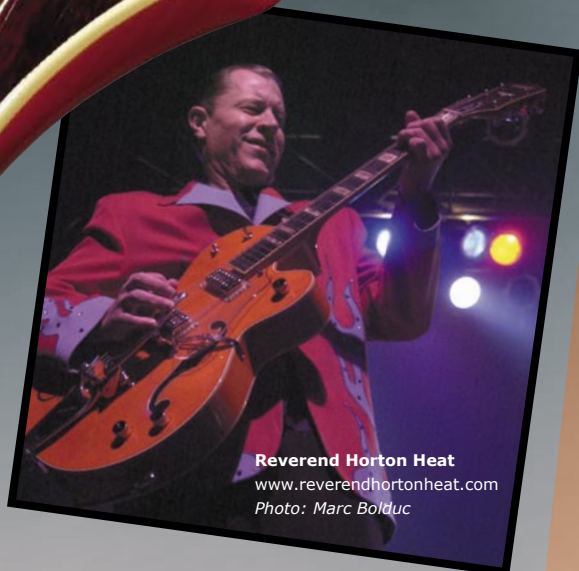
Reverend Horton Heat www.reverendhortonheat.com